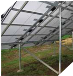
Underside of large ground mount