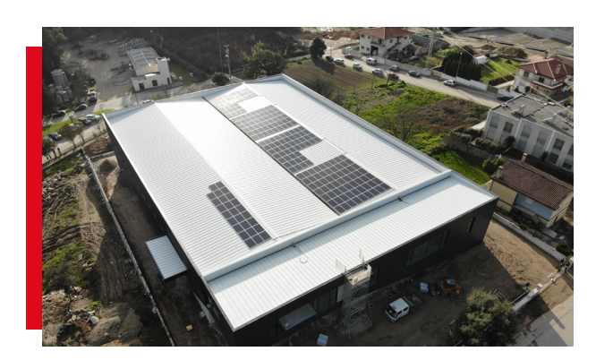
PV modules: 230