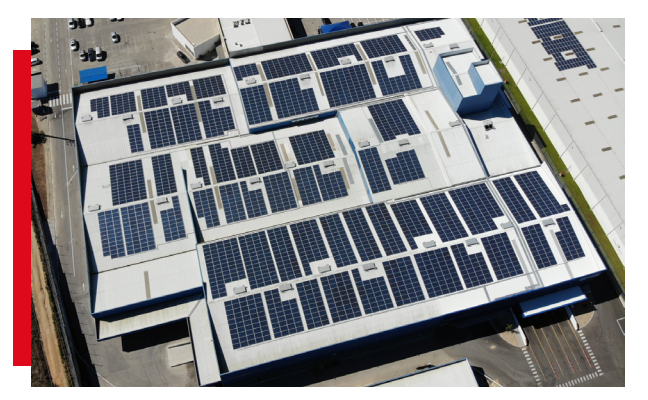
PV modules: 2556