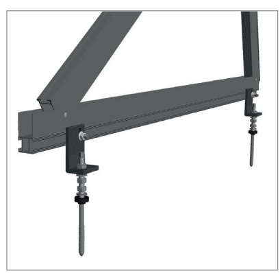
Adapter for hanger bolts