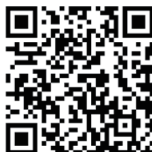
QR Code for On-line Shopping Sotore www.xinpuguang solar.com