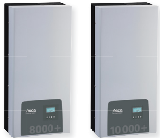
StecaGrid 8000+ 3ph