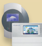
Solar-Log 500/1000™ and Meteocontrol WEB'log Comfort Accessories