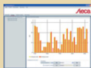
StecaGrid User Visualisation software