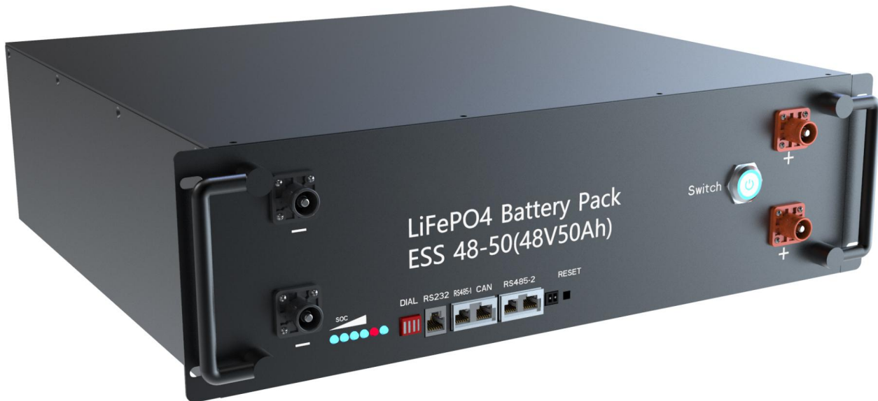
LiFePO4 Battery Pack