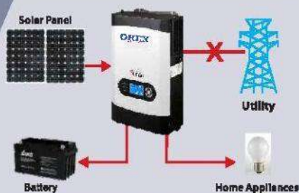
AC failed status