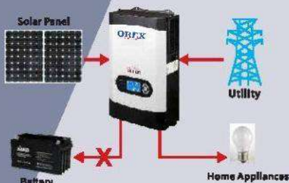
without battery status