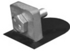
LT - Lug Terminal