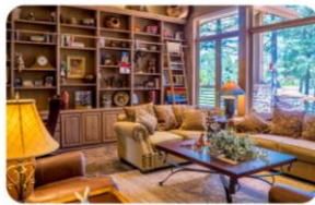
Household power storage, etc