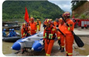
emergency and disaster relief