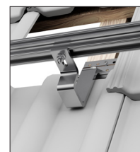
Double Roman Tiles