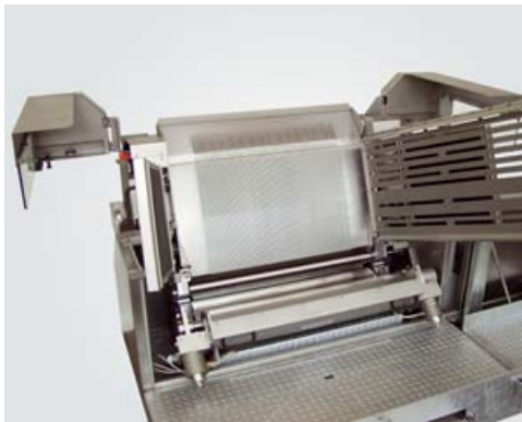
M-USG 1200 V strand guide