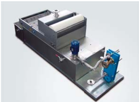
Process water treatment system PWS-BF