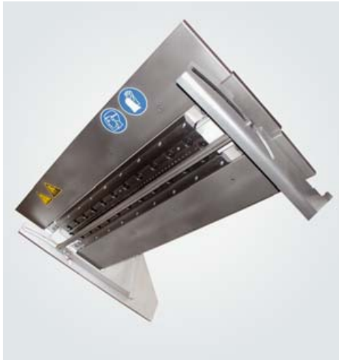
Die head with die wiper

Optimum component selection ensures high guarantees of availability, making the pelletizing process more cost-effective. Due to system layout operators have easy access for operation and maintenance.