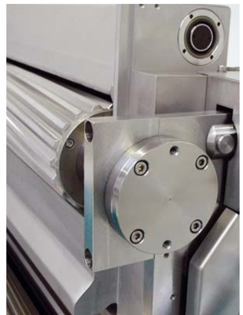
Roller bearing support outside of cutting chamber