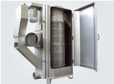
CENTRO centrifugal dryer

Underwater pelletizing strand systems – Only the quality of the system configuration counts