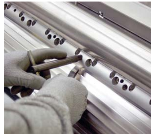
Cutting gap setting