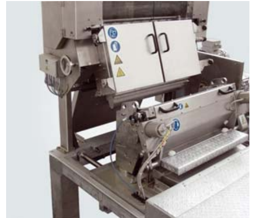
M-USG 900 V