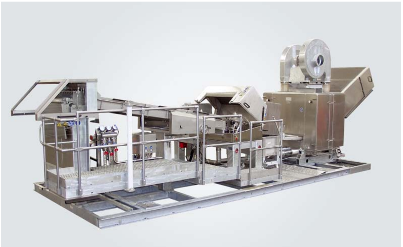
M-USG 900 H