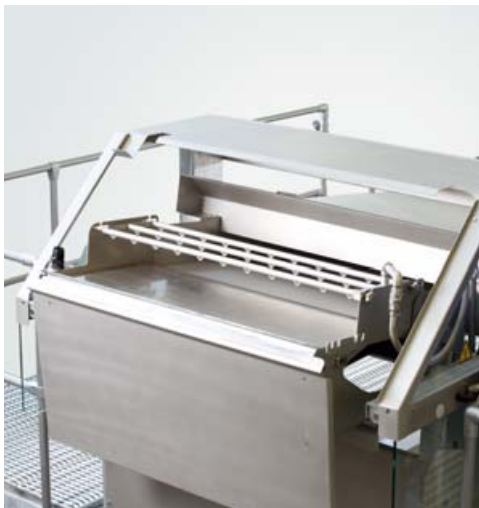
M-USG 1200 H start-up device