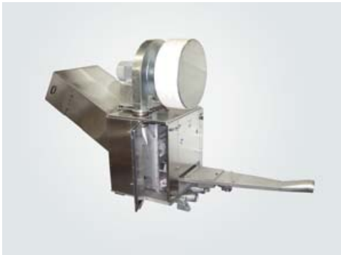
AERO impact dryer