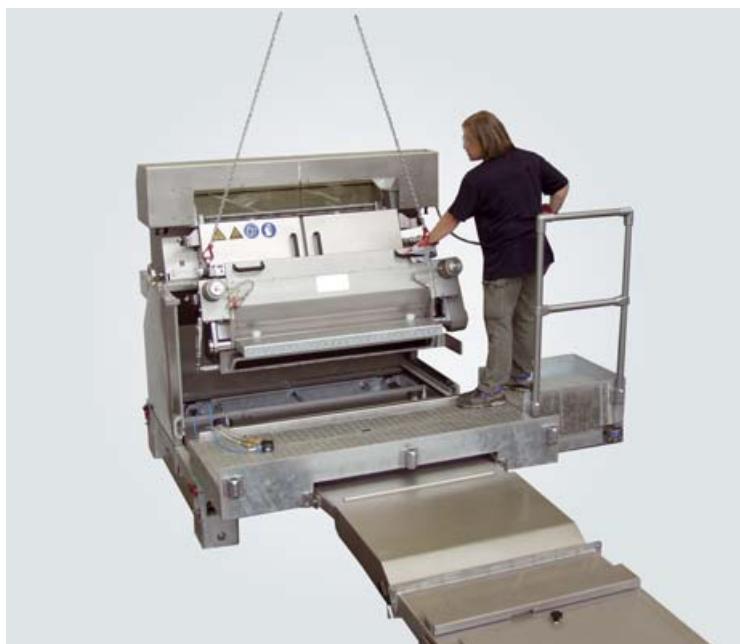
Cutting head quick-change