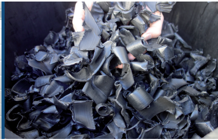
Fig. 2: Shredded material