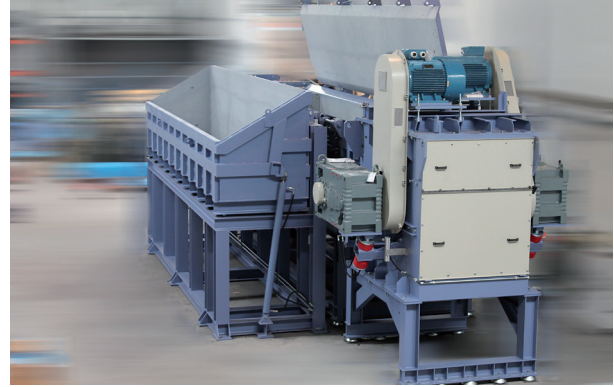
Step 1: Material to be fed in is put in the tiltable storage trough