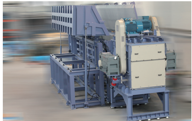
Step 2: Supply hopper "tips" the material into the hopper