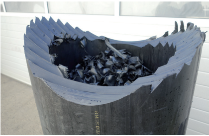
Fig. 1: Feed material e.g., PE pressure pipes