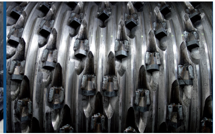
Fig. 3: EWS-R Rotor