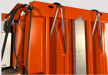
Pipes for easy bale strapping

This model comes with a cross cylinder and offers an extra compact machine design with a transport and installation height of only 2000 mm. The low height simplifies transportation to the installation site and provides broad location opportunities.