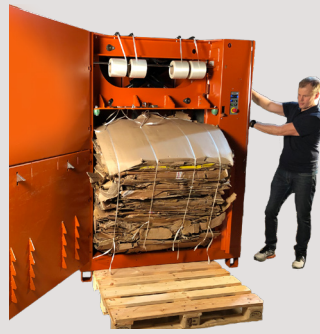
Simply push two buttons for bale ejection!