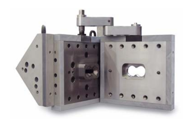
SG-C 300 die head: A swivel joint ensures quick access to the extruder screw