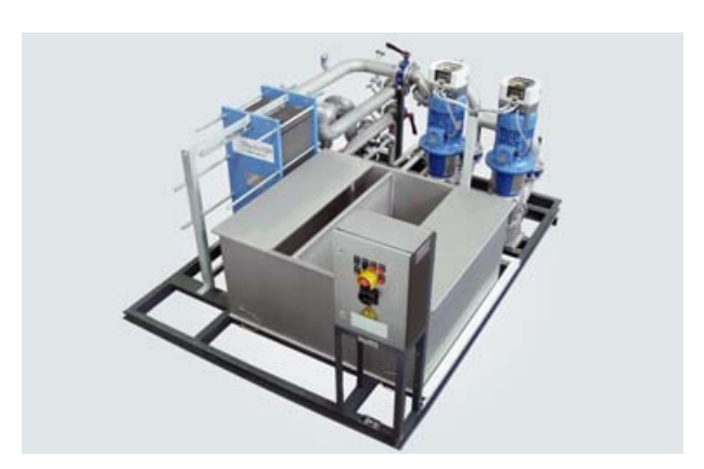
PWA 20 process water unit