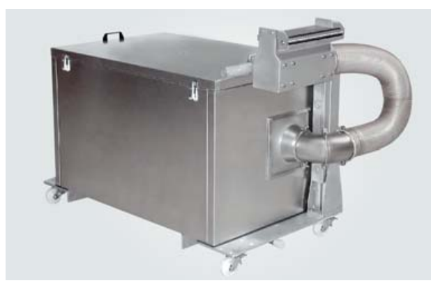
SE 400-2 air knife