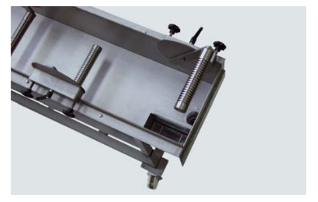
KW 600 cooling trough