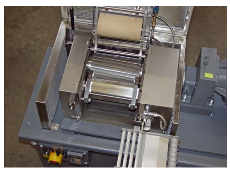
Looking into the cutting chamber