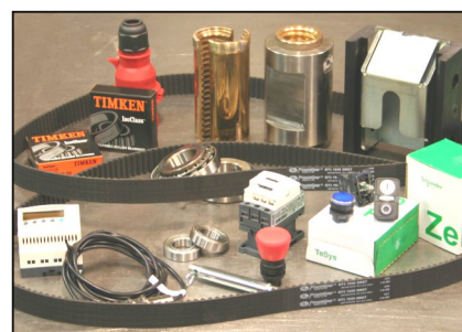
Components from global world class suppliers ensure quality and availability.