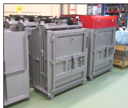
Since the mid-sixties more than 15,000 balers have been delivered all over the world.