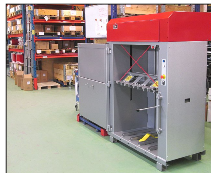
The door of NP80-II can be fully opened (180°), so that the bale can be easily removed even in small spaces.