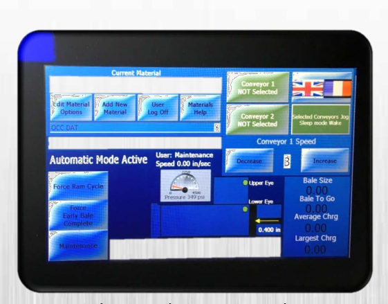
Color Touch Screen Display

Solutions for Waste Handling and Recycling