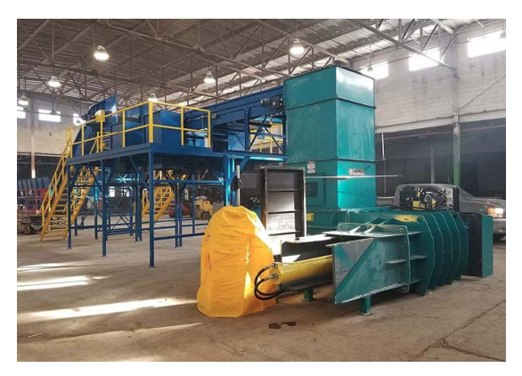
HM-2R185 Two Ram Horizontal Baler