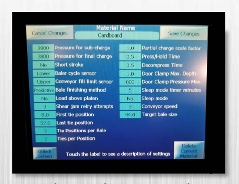
Color Touch Screen Display

Solutions for Waste Handling and Recycling