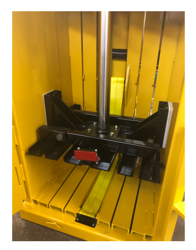
Hydraulic Strap Eject System