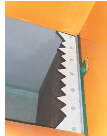
Pictured above: Heavy duty serrated cutting knife makes light work of cutting and baling with the minimum amount of effort.

Photographs for illustration purposes only