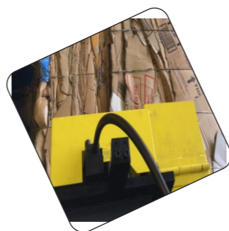
OCC Cardboard Baling