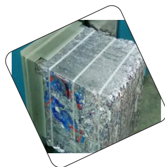
Plastic Paper Baling