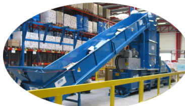
OPTION: CONVEYOR BELT