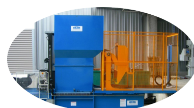
OPTION: BIN LIFTER

We reserve the right to make changes to specifications without prior notice. Bale weights are dependent upon material type.